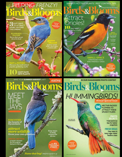
Birds & Blooms Magazine