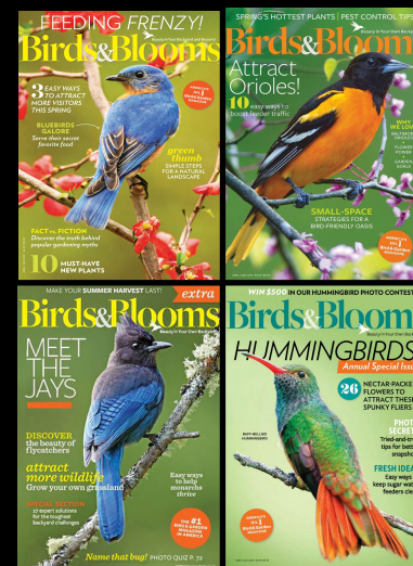
Birds & Blooms Magazine

Midwest Gardener's Handbook Small Space Gardening Midwest Lawn Guides Minnesota & Wisconsin Getting Started Garden Guide Month-by-Month Gardening in Minnesota & Wisconsin Michigan Getting Started Garden Guide Month-by-Month Gardening in Michigan Month-by-Month Gardening in Iowa