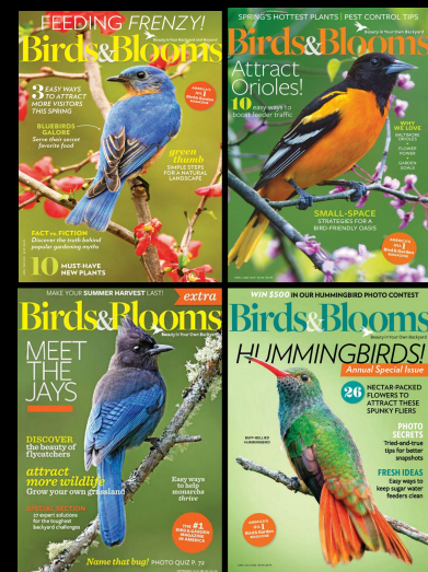
Birds & Blooms Magazine

Midwest Gardener's Handbook Small Space Gardening Midwest Lawn Guides Minnesota & Wisconsin Getting Started Garden Guide Month-by-Month Gardening in Minnesota & Wisconsin Michigan Getting Started Garden Guide Month-by-Month Gardening in Michigan Month-by-Month Gardening in Iowa