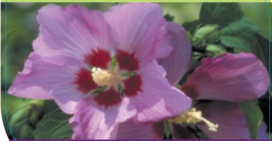
'APHRODITE' APHRODITE ROSE OF SHARON