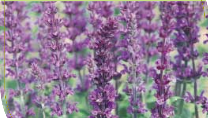
SALVIA X SUPERBA 'BLUE HILL' FLOWERING SAGE